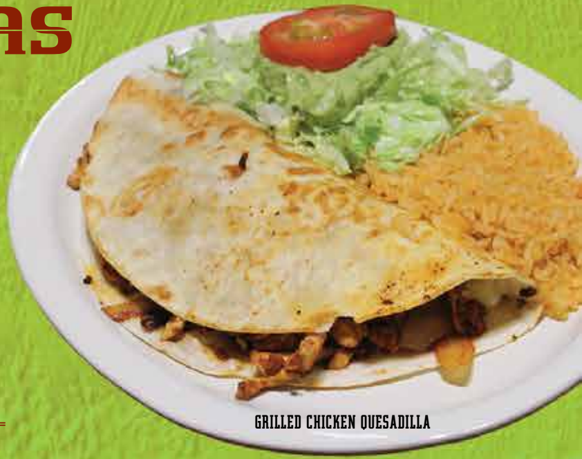
GRILLED CHICKEN QUESADILLA

A big grilled quesadilla with chicken, steak and shrimp served with rice and guacamole salad 14.25