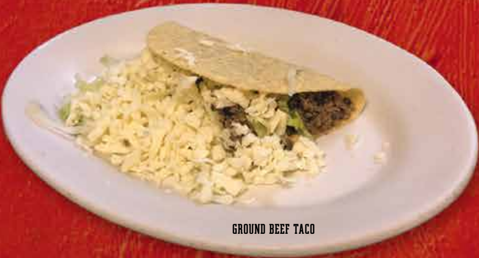
GROUND BEEF TACO