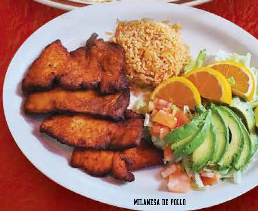
MILANESA DE POLLO